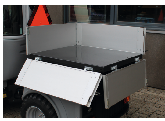
The truckbed is constructed with a completely flat bottom and fold-down aluminium sides and tailgate.