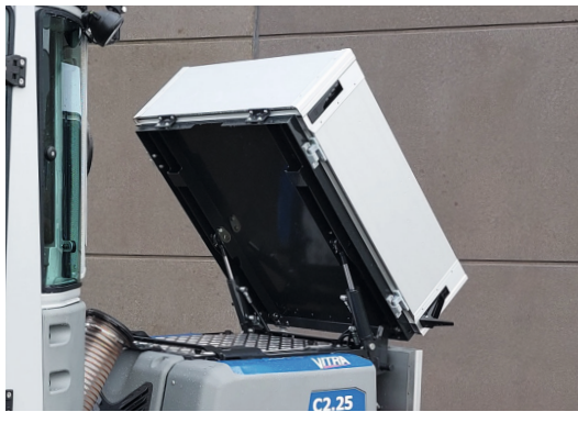
As an option, the truck bed can be mounted with hydraulic tilt for easy unloading - For example, directly in a rear-mounted spreader.