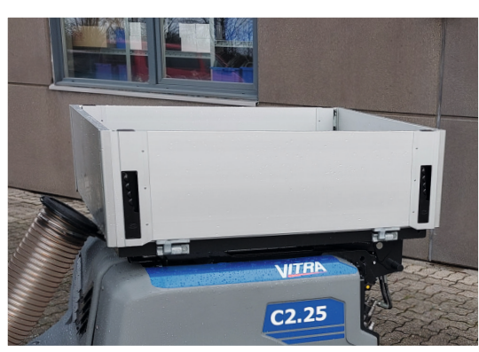
The truck bed is built as a strong steel/aluminium construction, which ensures low weight and large load capacity.

QUICK MOUNTING Mounted with Vitra Quick-shift